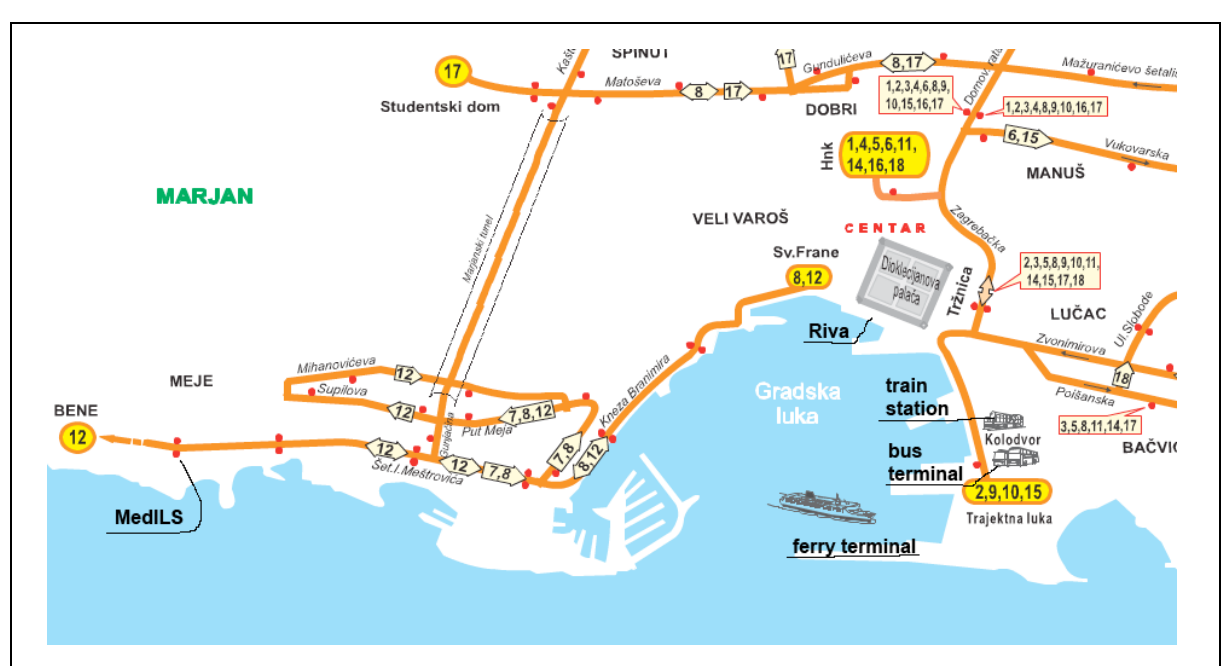
Map 2: Bus Nr. 12 connects the city center (Sv. Frane, west end of Riva) and MedILS.