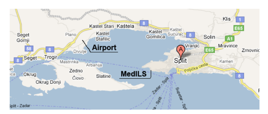
Map 1: Split airport is located about 30 to 45 minutes outside Split, near the town of Trogir

Split airport is located about half an hour to 45 minutes (depending on traffic) outside Split, near the town of Trogir (see map 1).